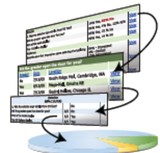
Survey Summary and Answer Summary